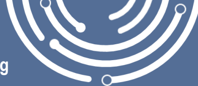
Exhibit 1. Current and past FLN-TWG members and their professional role while serving on the FLN-TWG