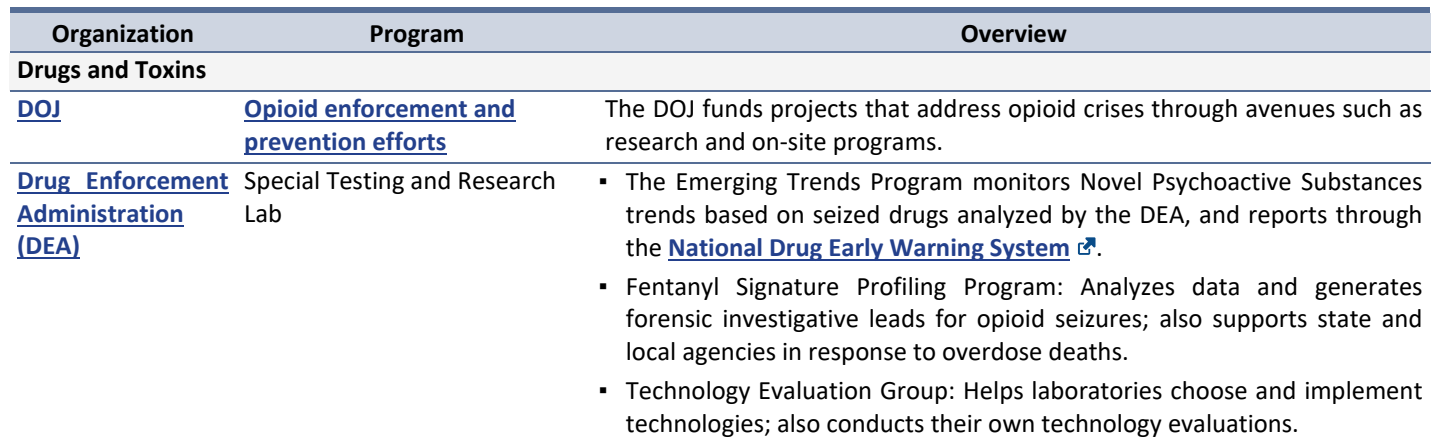
Exhibit 2. Resources crime laboratories can leverage by organization, program, and overview

Additionally, the FLN-TWG met with FEPAC commissioners to discuss the challenges they encounter when hiring new college graduates including a lack of hands-on training and challenges passing background