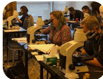
Workshop participants examining wood fragments.

The identification of an unknown wood fragment can be accomplished in two ways: 1) through a physical match with a known sample or 2) through an examination of its macroscopic and microscopic features. These wood fragment examinations can help to determine if the unknown fragment originated from the same type of wood as the known sample.