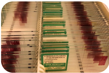
Reference slides can aid in the microscopic characterization of an unknown fragment.

As with other types of trace evidence, wood fragments can help reconstruct the events surrounding a criminal investigation. Through a comprehensive examination, an analyst can determine if an unknown fragment originated from the same type of wood as a known sample and possibly connect the two pieces via a physical match. This workshop provided participants with a foundation in forensic wood identification and illustrated how this type of evidence can be useful in casework.