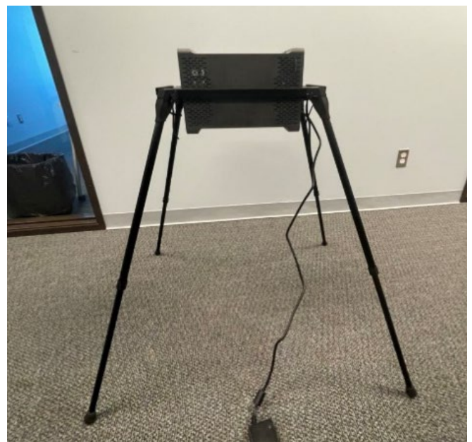
Exhibit 4. Side view of new tripod design.