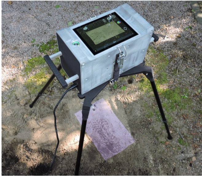
Exhibit 2. 3D scanner set-up to capture a footwear impression in soil.

option would be preferable, but some were willing to consider purchasing the scanner without it.