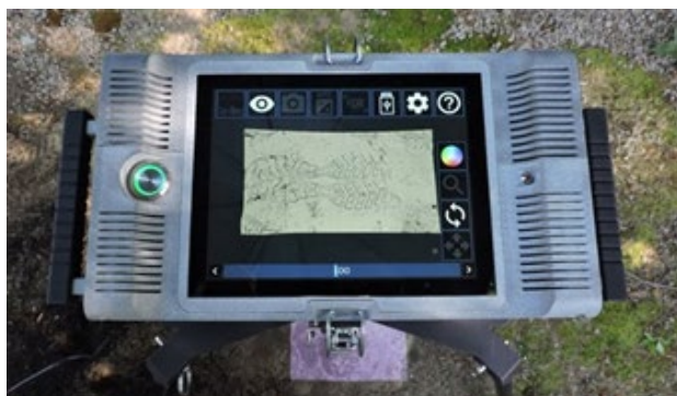
Exhibit 5. Overhead view of touchscreen interface with footwear scan on screen.