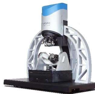
Caption: focus variation

In focus variation, the in-focus plane of reflected light is scanned in the z direction (vertical) to provide a complete picture of an object. The image is mathematically reconstructed by combining multiple images—each with a very shallow depth of focus—into a virtual 3D view. Focus variation microscopes accommodate large working distances, which may be convenient for imaging the curved or deformed surface of a bullet and steep edges such as those found in firearms examination. When considering a focus variation instrument, the laboratory should consider vertical resolution carefully because some lower priced instruments may not have the resolution required for tool mark