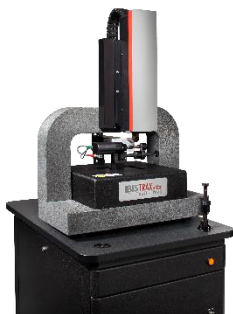
Caption: confocal microscopy

Confocal microscopy is the most common type of optical microscopy in applications outside of firearms identification, at least with respect to the number of system vendors. Carl Zeiss AG, Keyence Corporation, Leica, NanoFocus, Olympus Corporation, Sensofar LLC, and Ultra FTI all make confocal microscopes that could be applied to firearms identification, although the instruments vary with respect to capabilities and ease-of-use for the examiner. In general, confocal microscopes have larger working distances, but this will depend on the objective being used. As in other systems, a confocal microscope using an objective lens with a higher numerical aperture (NA) will have lower working distance and higher maximum measurable slope surface, while an objective lens with a lower NA will have a higher working distance and lower maximum slope surface. For example, the Leica DCM 3D Dual Core Measuring Microscope has a 17 mm vertical scanning range, one of the highest among confocal microscopes. For reference,