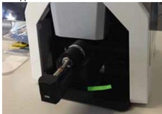
PH-5000 Interferometer microscope: example of coherence scanning interferometry technology

Coherence scanning interferometry (CSI), also called vertical scanning interferometry or scanning white light interferometry, measures changes in interference signal strength as the surface or instrument is scanned in the z direction. Basically, the technique assumes that each point on a surface is a mirror and finds the point by shining coherent light at the surface and looking at the resulting constructive interference patterns. (The interference signal results from combining the light reflected from the surface under examination with light reflected from a smooth reference surface.) Interferometric microscopes have smaller working distances and may not adequately image steep slopes on a surface. Bruker Corporation, Leica, Pyramidal Technologies, Sensofar LLC, Taylor Hobson, and Zygo Corporation produce microscopes that are based on interferometry and may be suitable for forensic applications.