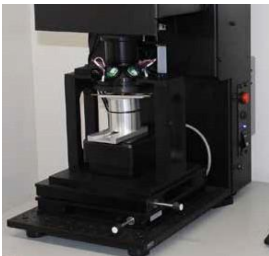
TopMatch-GS 3D Version 2 Scanner: example of photometric stereo technology

There are other approaches, including scanning electron microscopy (SEM) or stylus profilometry, but, in general, these methods are not used in firearms identification in the crime laboratory. SEM has been used in Europe and the U.S. Fish and Wildlife Service Forensics Laboratory. Stylus profilometry is a contact method that may damage the sample, a significant drawback in the forensic laboratory.